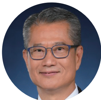
The Honourable Paul CHAN Mo-po, GBM, GBS, MH, JP 陳茂波先生，大紫荊勳賢， GBS，MH，JP

Financial Secretary, The Government of the Hong Kong Special Administrative Region 香港特別行政區政府財政司司長